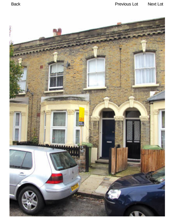
Download Legal Documents