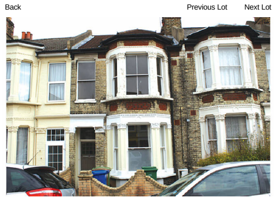
Download Legal Documents

Viewing. Please refer to Viewing Schedule