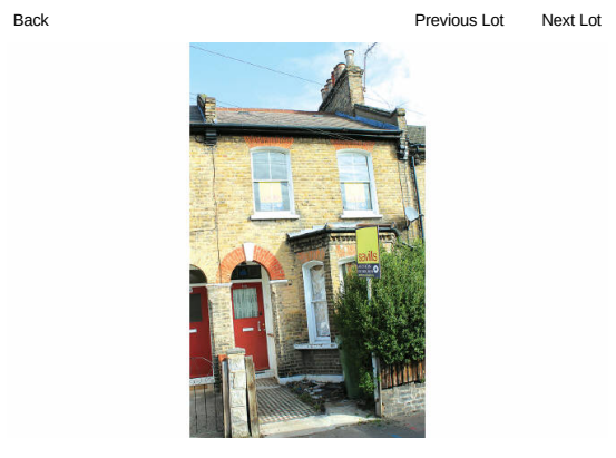
Download Legal Documents