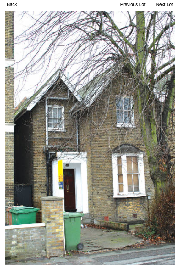
Download Legal Documents