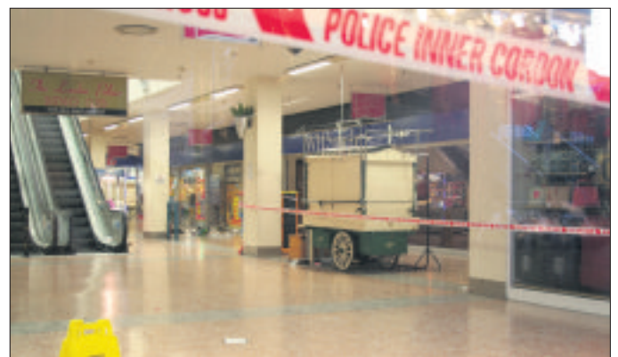
The taped off crime scene within the shopping centre

A 33-year-old man was arrested on Monday and has subsequently been bailed until February.